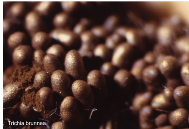
Fig. 1 Trichia brunnea (holotype, Cox 570, UC), a coprophilous species known from very few collections. Individual sporocarps are about 1.5 mm in total height

Kelleromyxa fimicola was originally described (as Licea fimicola ) from the state of Manitoba in southern Canada